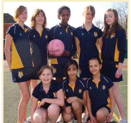
Year 7 Netball Team

All our teams are doing well in the Reading Schools Netball, all improving match on match.